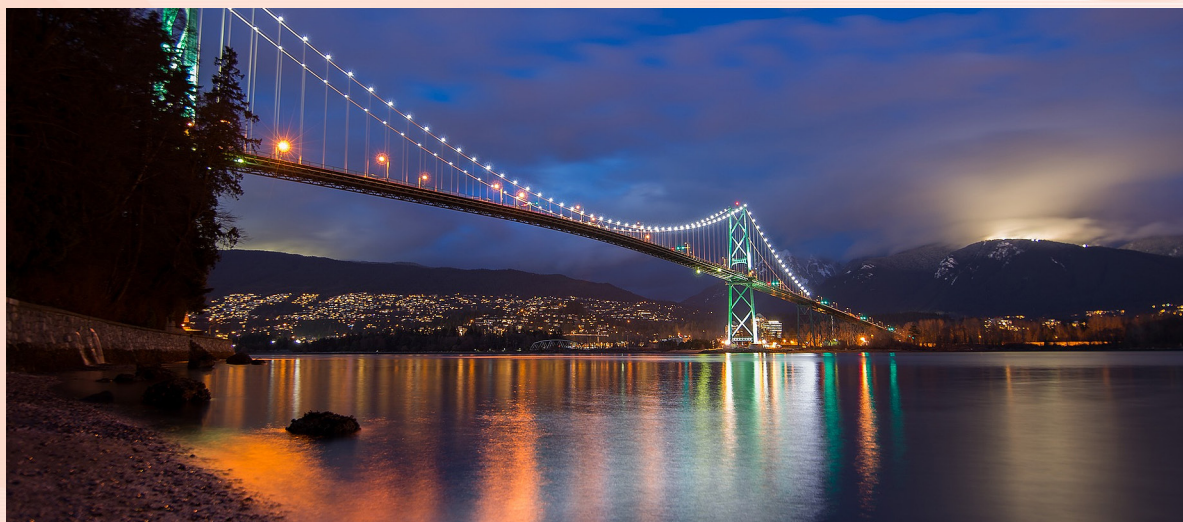
Vancouver, Lion's Gate Bridge

As big metadata is pivotal for the data-intensive research, learning, health, and busi-