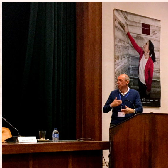
Fig. 2 Keynote speaker: Wolfgang Glänzel

and beyond? Background, promises, challenges and limitations of alternative metrics “.