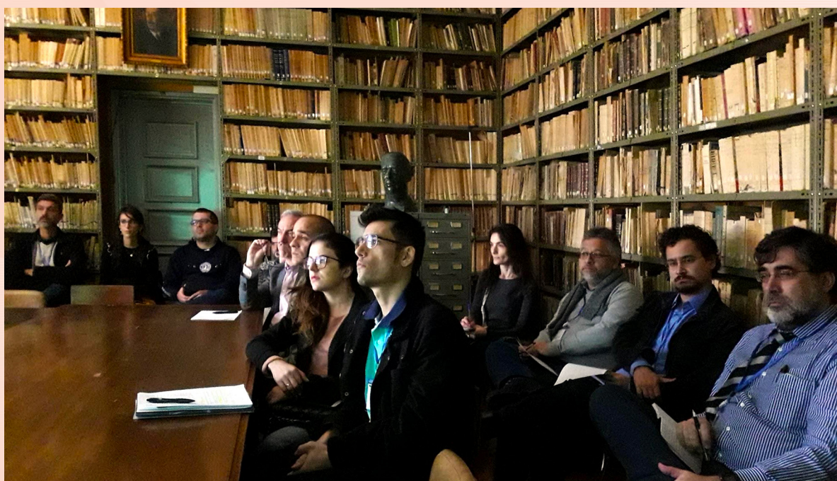
Fig. 3 Doctoral Consortium: students from PhD programs from Portugal, Spain and Brazil

The next Iberian Encounter EDICIC 2019 will be held at the University of Barcelona, Spain, in the month of July 2019.