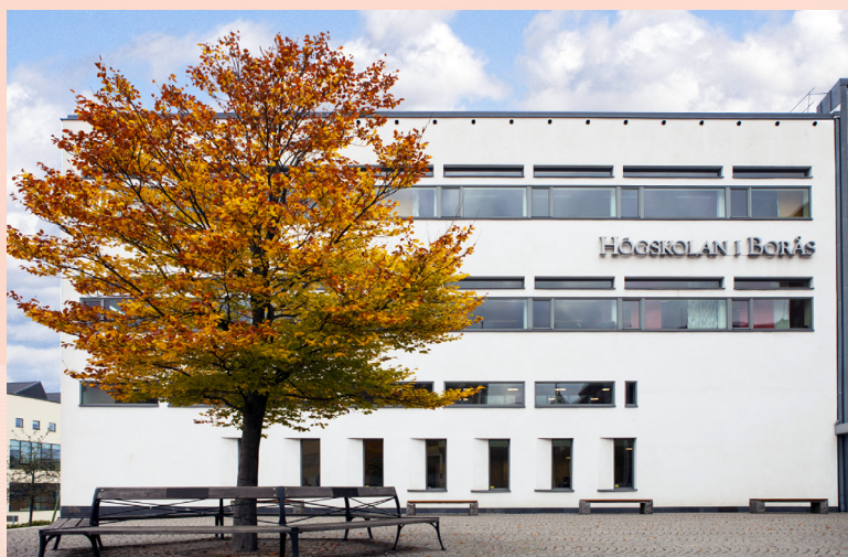
University of Borås.

stract of their presentation. We welcome novel ideas or work-in-progress of interest to a Nordic audience and this year we especially encourage papers with a research policy perspective. You can offer either a paper or a poster. Due to limitations in the program the scientific committee may suggest that paper submissions should be given as posters. Papers will be presented orally at the work-