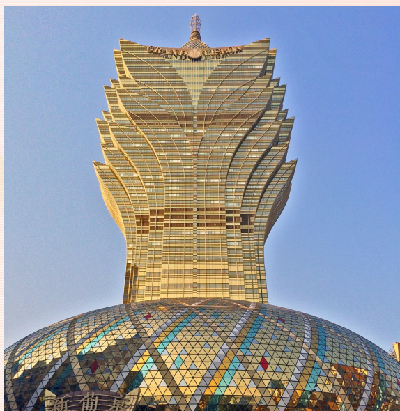
Macao (China). Photo courtesy of © Svea Freiberg. (Published under Creative Commons CC0)